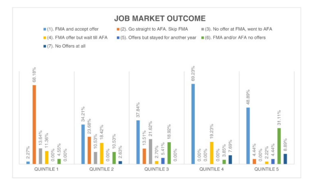
Figure 2: Job Market Outcomes

What Proposition 5.3 states is also in line with the empirical evidence on the job market for finance Ph.D. candidates. Every year, there are two conferences that provide placement services to the finance Ph.D. job market: the FMA in October and the AFA in January. Using survey responses of 237 former first time job market participants who sought a placement between 2007 and 2015, Volkov et. al (2016) defines several empirical measures of success at various stages of the job market. Based on their sample of 237 candidates, 45.8% of them went only to the FMA, 23.3% went only to the AFA, and 25.8% went to both. They found that a vast majority of top quintile candidates skipped the FMA and secured jobs at the AFA. The FMA appears to dominate the job market for lower quintile candidates. The percent of candidates who go to the FMA and accept a job is 34%, 38%, 69%, and 49% for the 2<sup>nd</sup>, 3<sup>rd</sup>, 4<sup>th</sup>, and 5<sup>th</sup> quintiles respectively. See Figure 2 for placement data in detail.